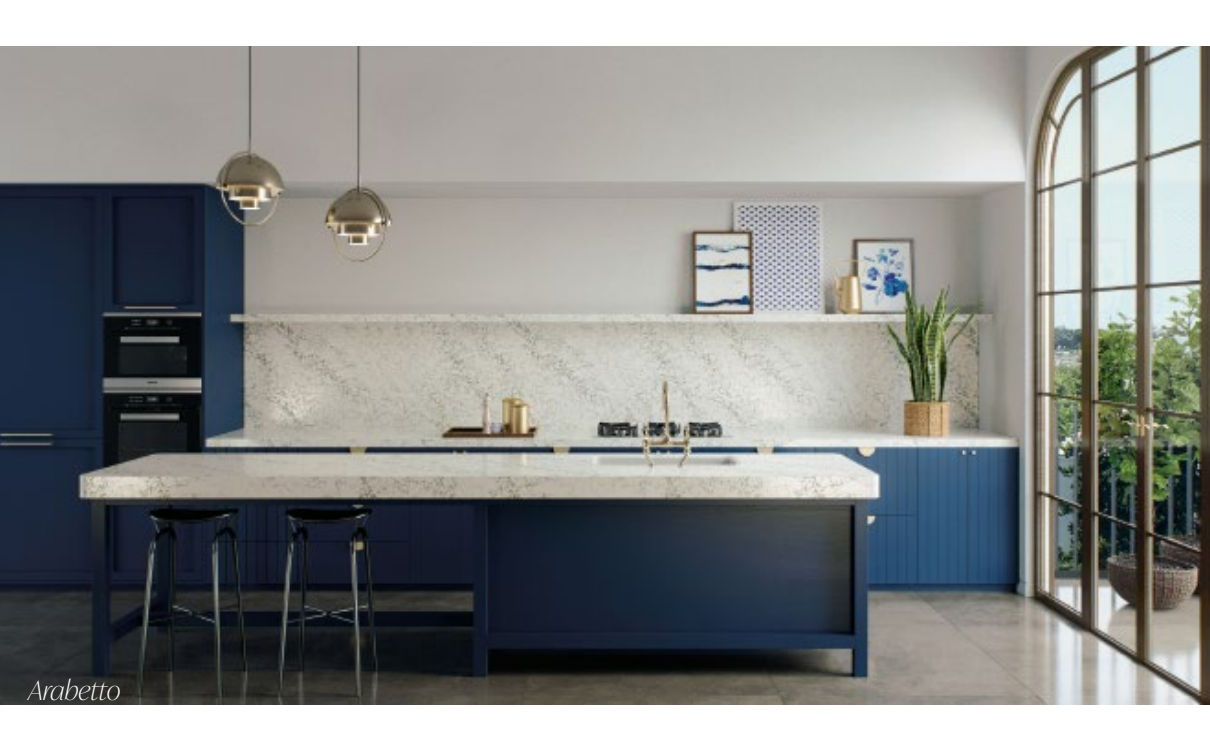
Simple to Clean & Maintain

GLAZE, the largest stone gallery in the Middle East, prides itself as the official distributor of Caesarstone - World's #1 Quartz Surface. As always, we hand pick and curate the finest products from every corner of the world, to enhance the aesthetic appeal of your spaces.